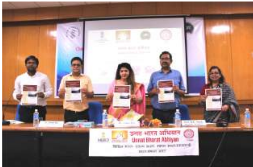
Image: First issue of UBA newsletter unveiled during the LAC meeting.

Indira Gandhi Delhi Technical University for Women (IGDTUW) applied in this programme showing its willingness to adopt five villages in Delhi State namely Sadar Bazaar, Daryaganj, Paharganj, Civil Lines and Seelampur. Our University has been shortlisted as the Participating Institute through a challenge mode application process. By involving faculty members and students & establishing tie ups with NGO's/ Voluntary Organizations/ persons already working in the village area, the first task was to establish a connect with the villages and thereafter survey of villages and households was undertaken.